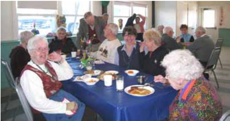
Some of last year's Pancake Luncheon diners enjoying this seasonal treat.