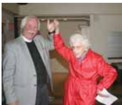
Forever young at St. Peter's

W e want someone who will be thrilled to take good pastoral care of us and not hesitate to challenge us when we need it. We want our spiritual life to grow from the heart out. We keep in touch and check in with each other. A number of people have been specially trained in a Calling and Caring program to discuss sensitive issues with parishioners. We cook for those among us who are ill or have new babies. We help with chores such as moving water-damaged books and putting a widow's garden to bed. We give rides, encouragement and hugs. We pray for each other. We bring Communion to shut-ins. We provided our deacon, who was diagnosed, treated and died from cancer this past