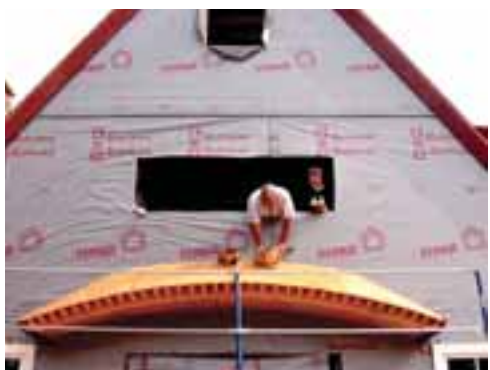
Placing crowns on our new construction

St. Peter's budget is just over $200,000. We raise about 80% of the budget through our Stewardship campaign, interest from funds invested from selling the rectory and through special fund-raising events throughout the year. The balance of the budget comes from endowment money. Our small endowment is invested in Vanguard and Domini funds and is reviewed regularly by the finance commission. We also have used it in recent years as scholarships for candidates for Holy Orders. The challenge for the future is to increase giving so that St. Peter's can use endowment funds for mission and outreach.