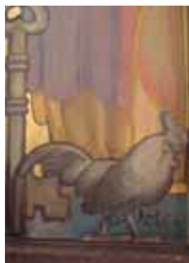
Symbols of our patron saint are depicted in an antique painting.

We explore art and music that bring a fresh perspective to our liturgy and meditation. Music is important enough that we share sanctuary space with a grand piano. We often wake ourselves up by dramatizing scripture or some bit of church business. We share our spiritual journeys through monthly sculpture, painting, photography and poetry exhibits in our Art of the Spirit Gallery. We host an annual area sing-along Messiah that includes professional soloists. We are also a venue for community recitals and musical events.