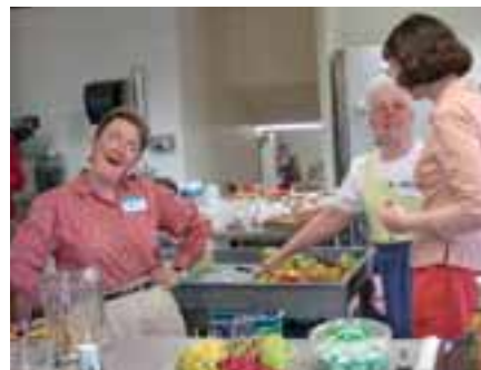
Our Loaves & Fishes cooks at work

H ospitality is a major part of our outreach. People of the community come and join us to keep things lively. Our team and teams from other churches, the synagogue, and service groups provide meals on Saturdays, Sundays and special holidays in our Loaves & Fishes feeding ministry. These noon meals for those in need of food or companionship began 20 years ago with tailgate sandwich service in our parking lot. The local Toy Library has used part of our space 13 years and provides a rich parenting program for young families and their children. Many 12-step programs and support groups meet here several times a week. For the past twenty years we have provided weekly visitations and a monthly service for our neighbor, The Knox Long Term Care Center , a local nursing home.