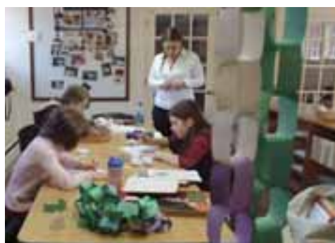
Sunday morning Christian formation activities are provided for children of all ages.

There is a continuing series of adult forums that meets between the two services so both congregations can participate. Topics range far and wide and have been focused on books and local and world issues. We've had forums on health, wellness and aging issues; forgiveness; Islam; meditation; and spirituality. Some are led by the rector, some by parishioners and some by guests who have written books or interact with our world in ways we want to know about. There is usually a Lenten study group that meets in the evenings. We host one of the three active Education for Ministry groups in this area and have many graduates who will understand some esoteric things you might want to throw into your sermons. We have trained mentors among us. Over the years various Bible study classes have formed and informed themselves.